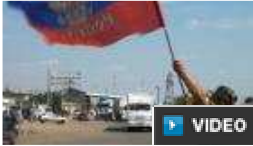
Tensions rise as Russian convoy crosses into Ukraine