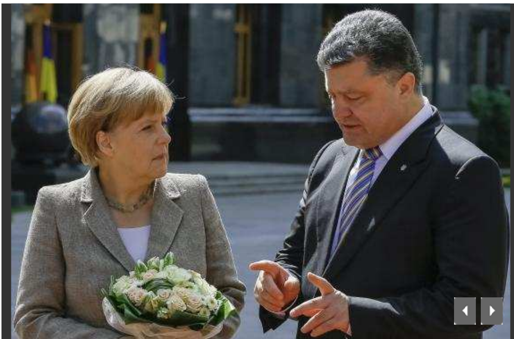
1 OF 9. Germany's Chancellor Angela Merkel looks on as Ukraine's President Petro Poroshenko gestures in Kiev August 23, 2014.

74 COMMENTS | Tweet 332 Share 24 Share this +1 50 Email Print