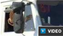
First trucks from aid convoy to Ukraine cross back into Russia